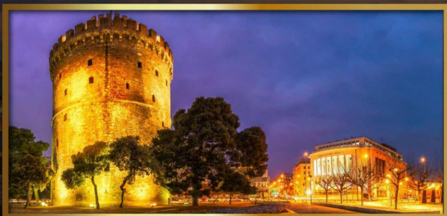
WHITE TOWER (LEFKÓS PÝRGOS) 15MIN WALKING

CHAMPIONSHIP, WORKSHOPS, PARTIES, SHOPPING, TOURISM AND MORE