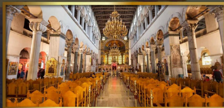
SAN DEMETRIO CHURCH (AGIOS DIMITRIOS) 15MIN WALKING