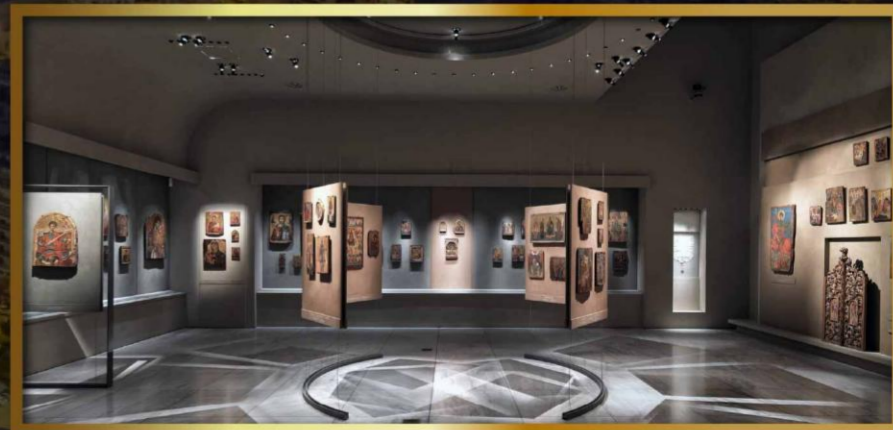
BYZANTINE CULTURE MUSEUM 15MIN BY CAR