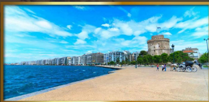
PEREA BEACH 30MIN BY CAR