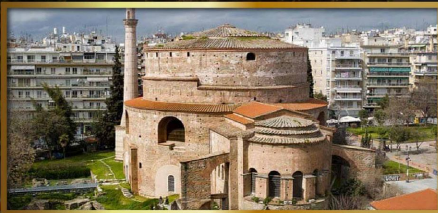
GALLERIO ROTUNDA 15MIN WALKING