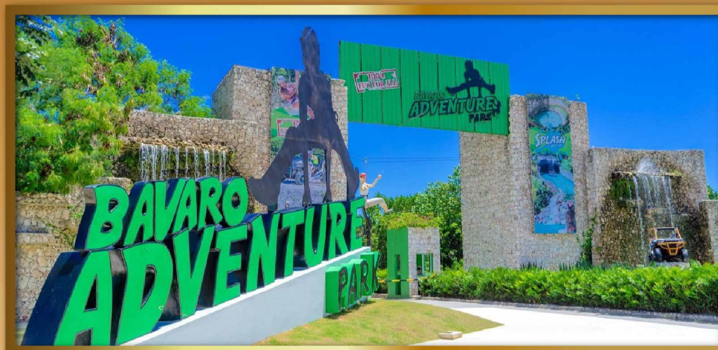
BAVARO ADVENTURE PARK