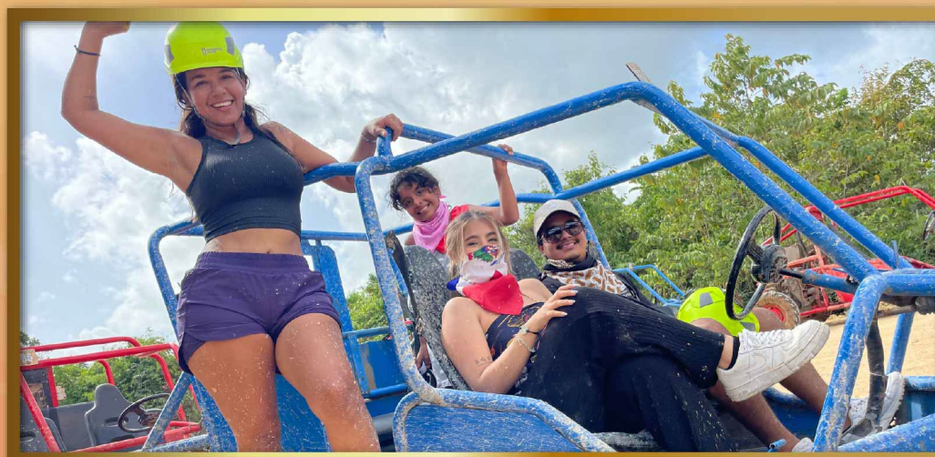
EXCURSIONES EN BUGGYS