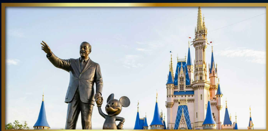
WALT DISNEY WORLD 15MIN

YOU WILL FIND THE BEST THEME PARKS AND ATTRACTIONS