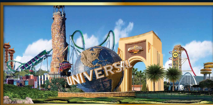
UNIVERSAL STUDIOS 15MIN