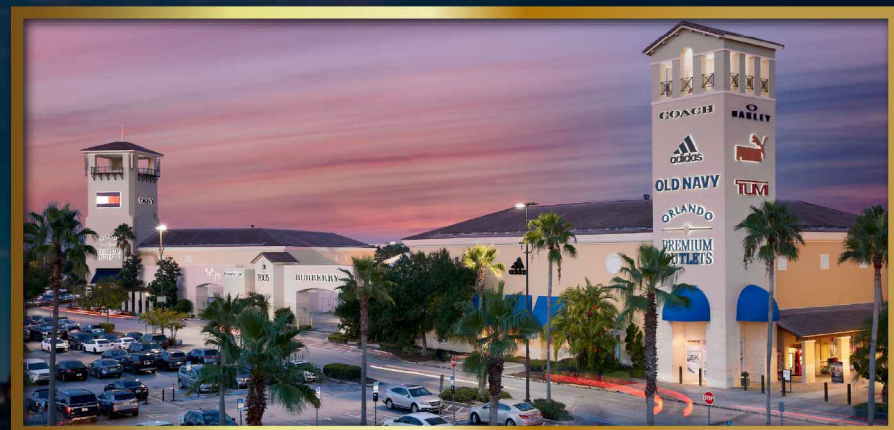
ORLANDO PREMIUM OUTLETS 15MIN