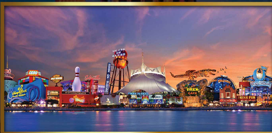
DISNEY SPRINGS 20MIN