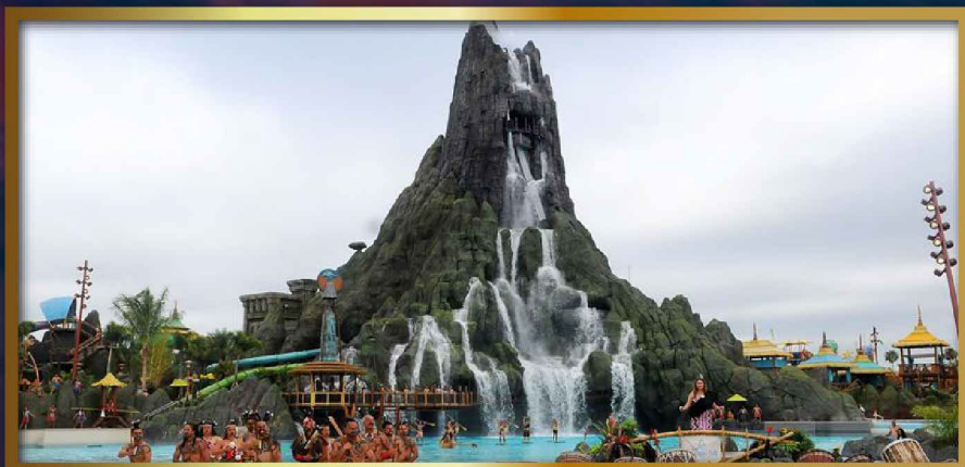
VOLCANO BAY 10MIN