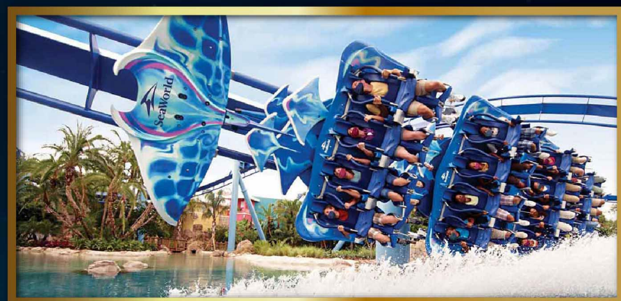
SEAWORLD ORLANDO 10MIN